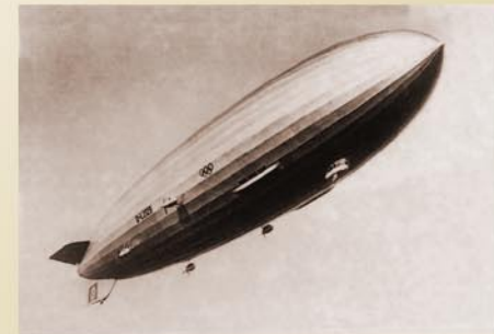
Airship LZ 129 Hindenburg

After the first crossing the instrument was exhibited at the factory but did not escape the fire. It was destroyed in 1943 when the factory burned down after an air raid.