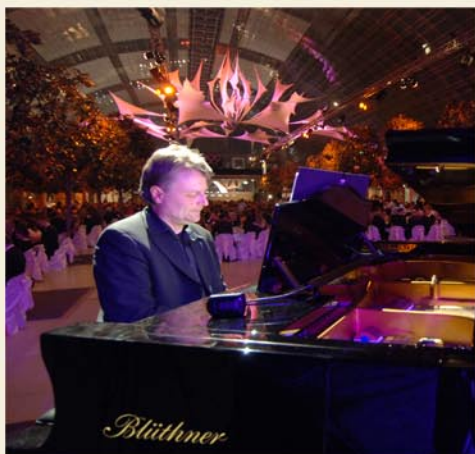
Leipzig Olympia Ball Night